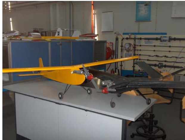
UAVs Lusitânia and Brutus